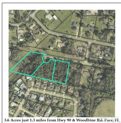
3.6 Acres just 1.3 miles from Hwy 90 & Woodbine Rd. Pace, FL